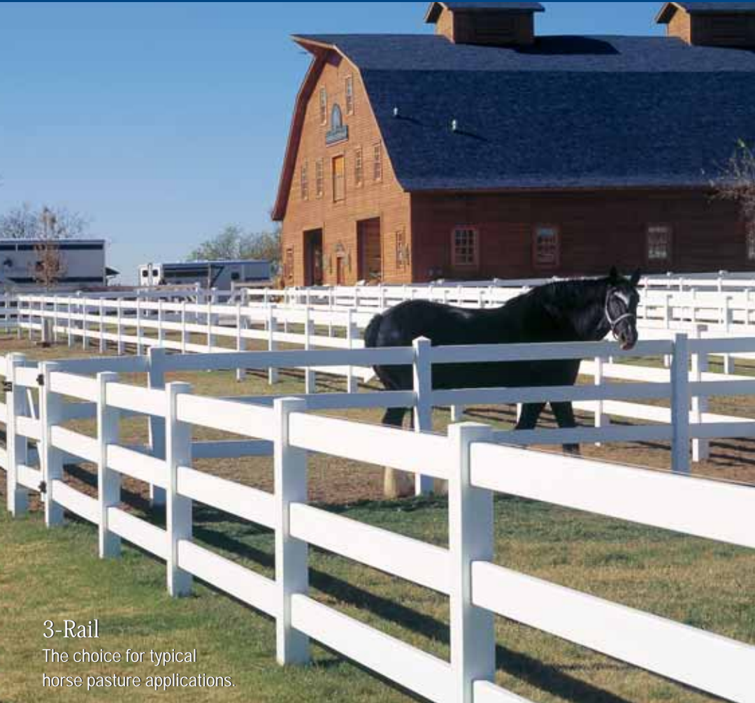
3-Rail The choice for typical horse pasture applications.